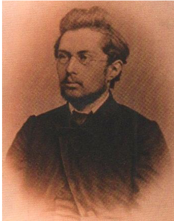
Figure I.2. Portrait of Warming at age 21 (Klein 2002, p. 19)

and Marbot 1986, p. 33; Gunthert 1999, pp. 13–14) 5 . These representations were intended to signify the social success or scientific notoriety of the person being “portrayed”. The physiognomy of the Swiss Johann Caspar Lavater was popular. Portraits were thought to reveal the personality, feelings emotions and even the soul of the subject.