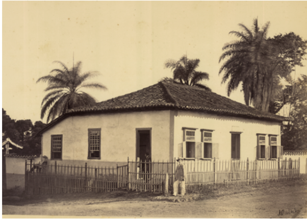
Figure I.1. Dr. Lund's house and garden, on the right in the image