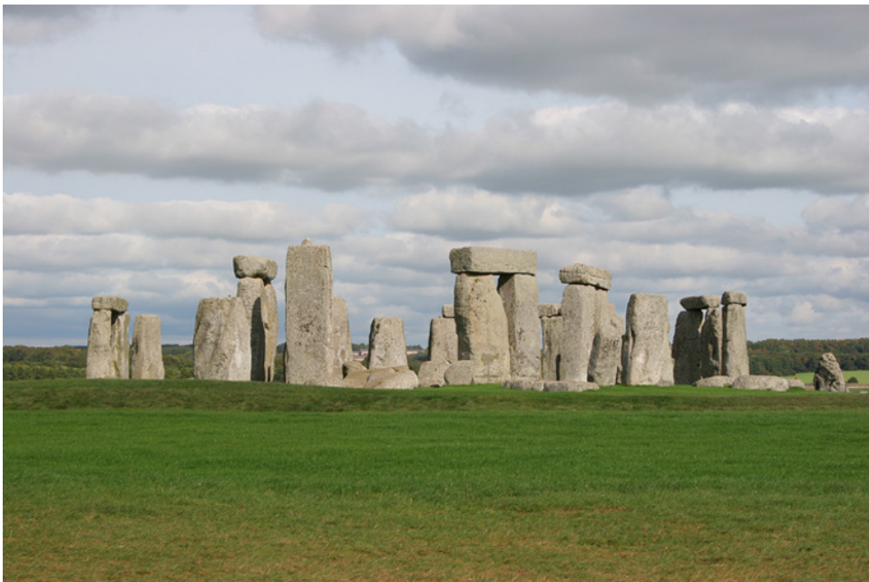
Figure 1.1 Stonehenge Monument, Wiltshire, UK.

In spite of the lack of definition of building performance, the concept has implicitly been around for a long time. As long as humans are concerned with shelter, performance will have been of importance. Emerging humanity will have selected caves to dwell in based on performance criteria such as protection from the elements, access and stability. Similarly, primitive dwellings must have been constructed with a focus on keeping the inhabitants safe from the weather and wild animals. But after some development, early humans have also constructed some formidable buildings such as the Stonehenge monument depicted in Figure 1.1 (3000 BC–2000 BC) or the Great Pyramid of Giza (2580 BC–2560 BC). Neither of these has reached the modern age with historical records of their full purpose and leave archaeologists to discuss the construction process and meaning of details; however both have fascinating astronomical alignments that may point to these buildings performing roles as solar clock or stellar representation.