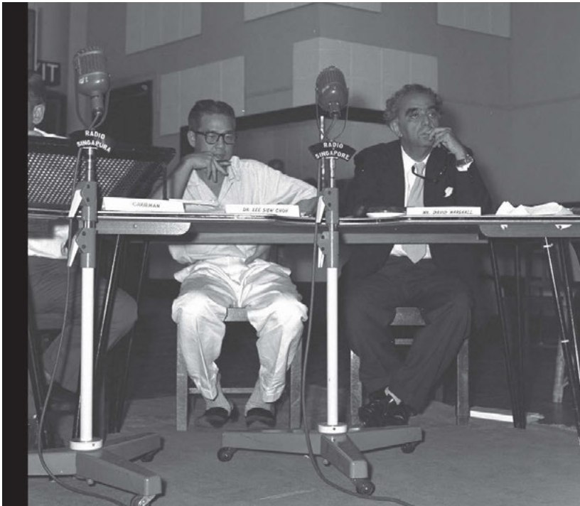
13) Lee Siew Choh and David Marshall at a Radio Singapore forum on the merger between Malaya and Singapore.