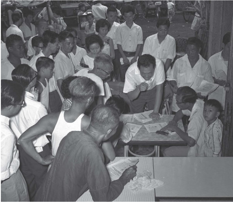
12) Lee Kuan Yew explaining options to voters during the National Referendum on the Singapore-Malaysia merger.