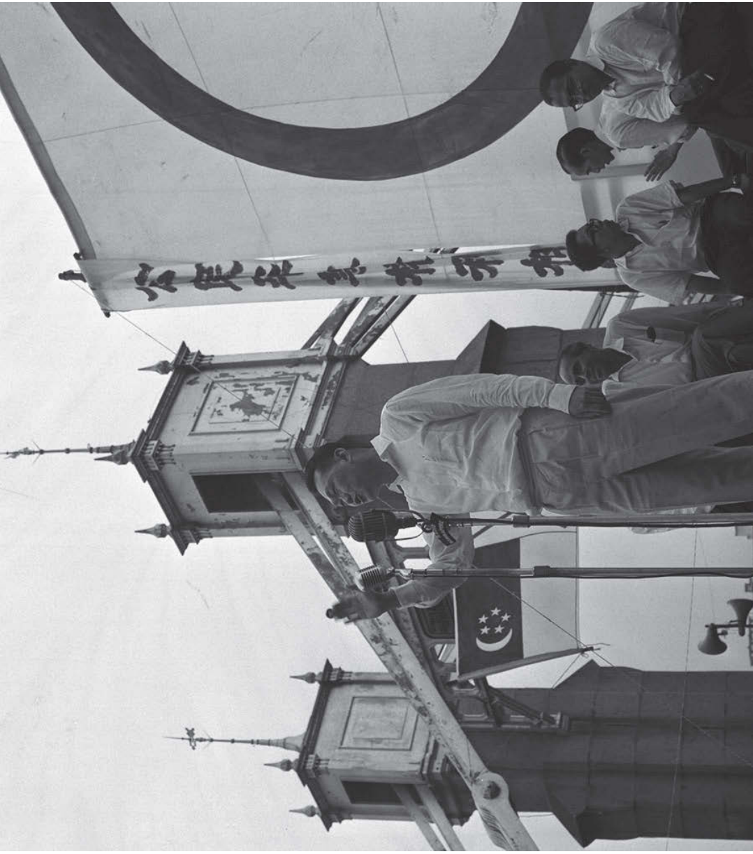
10) Lee Kuan Yew speaking at a rally on the merger referendum (August 1962).