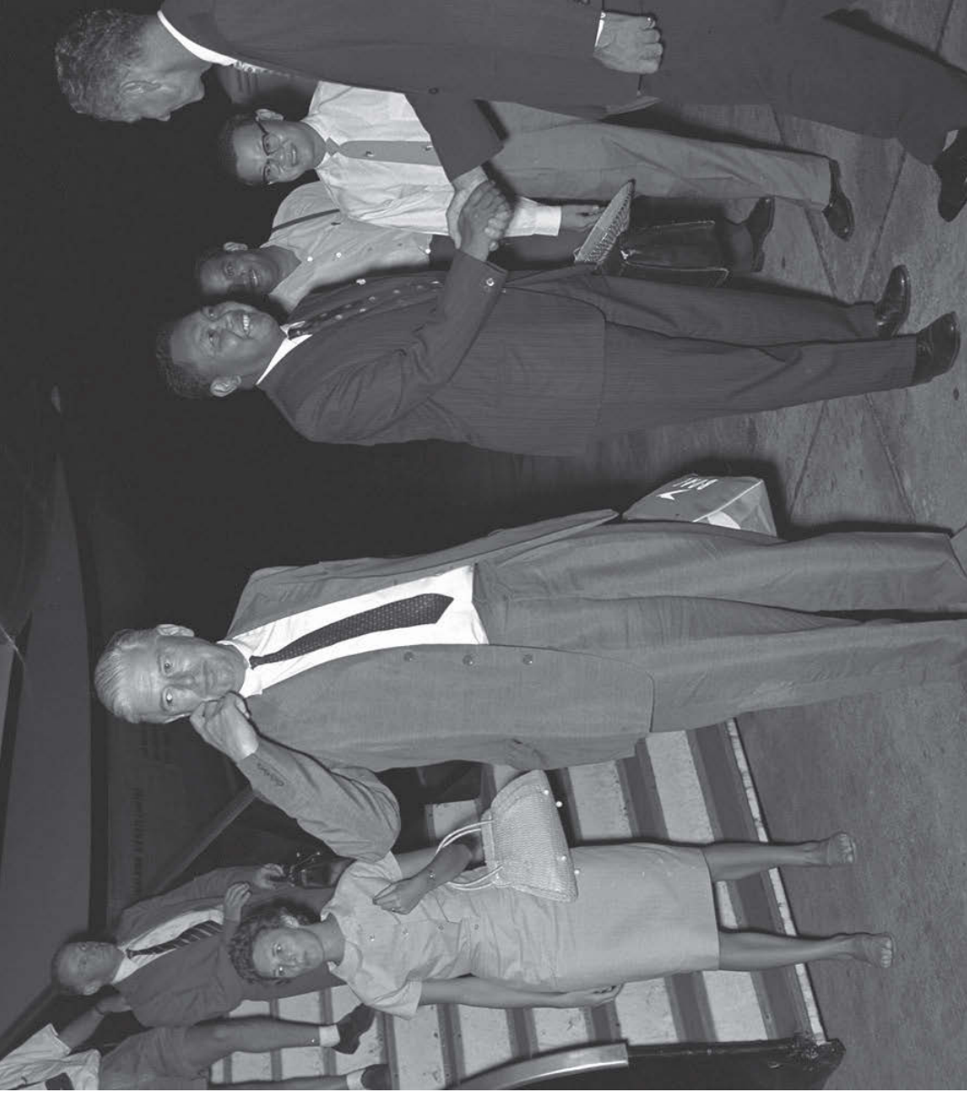
7) Lord Cobbold and other members of the Commission of Enquiry at the Singapore Airport after flying in from Kuching.