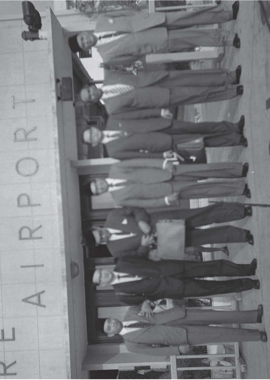
2) Delegates from the Federation, North Borneo, Sarawak and Singapore coming together for the first meeting of the Malaysia Solidarity Consultative Committee in Singapore (August 1961).