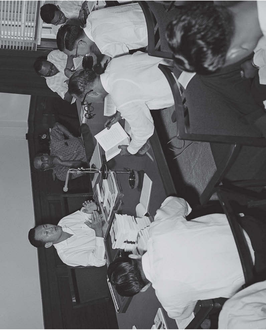
3) Lee Kuan Yew addressing a press conference on Singapore-Malaya merger. On his left is S. Rajaratnam.