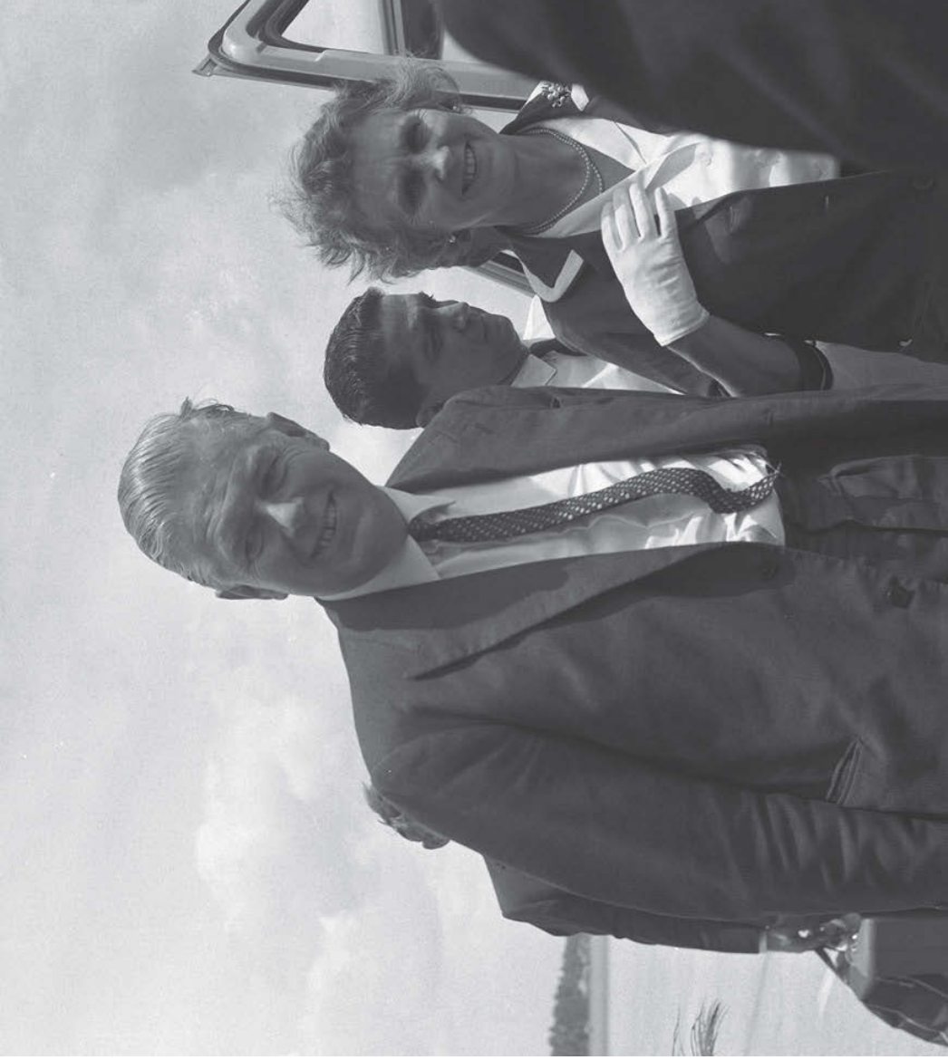
5) Chairman of the Malaysia Commission of Enquiry, Lord Cobbold arriving in Singapore before leaving for the Borneo Territories (February 1962).