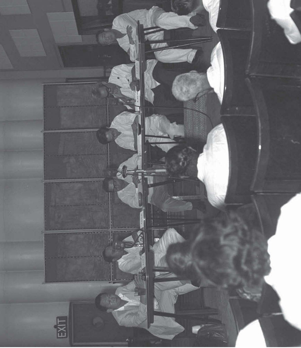
14) Lee Kuan Yew and Goh Keng Swee in a radio debate with members of opposition parties on Singapore-Malaya merger.