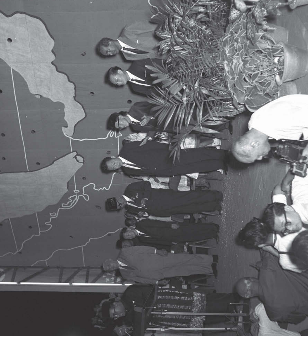
9) Tunku Abdul Rahman and Lee Kuan Yew being welcomed at the airport on their return from talks in London (August 1962).