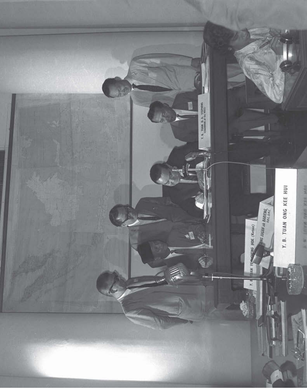
6) Chief delegates from Sarawak, North Borneo, Brunei, Singapore and Malaya signing the Memorandum for Malaysia in Singapore, in February 1962.