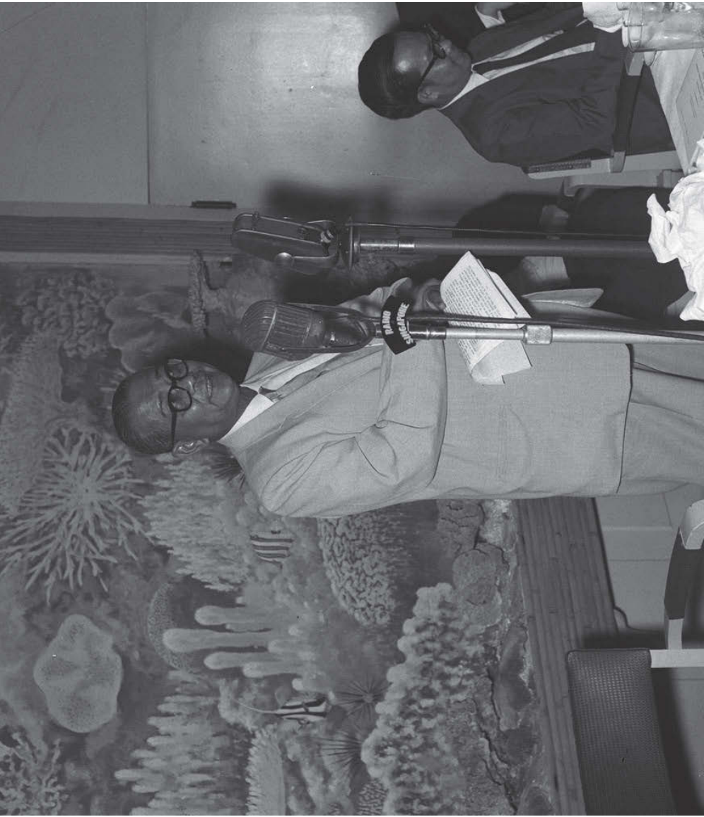
1) Malayan Prime Minister, Tunku Abdul Rahman, addressing the Foreign Correspondents Association of South-East Asia, where he broached the "possibility of bringing the territories of Singapore, North Borneo, Brunei and Sarawak and the Federation of Malaya closer together in political and economic co-operation".