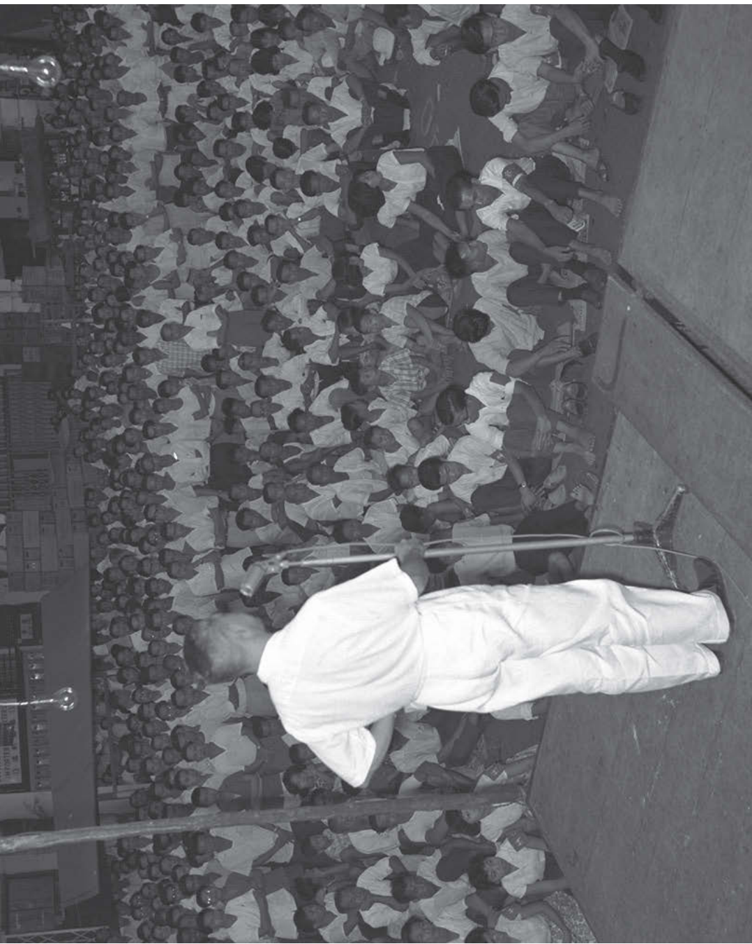
11) Lee Siew Choh addressing a Barisan Sosialis rally on the Singapore-Malaysia merger.