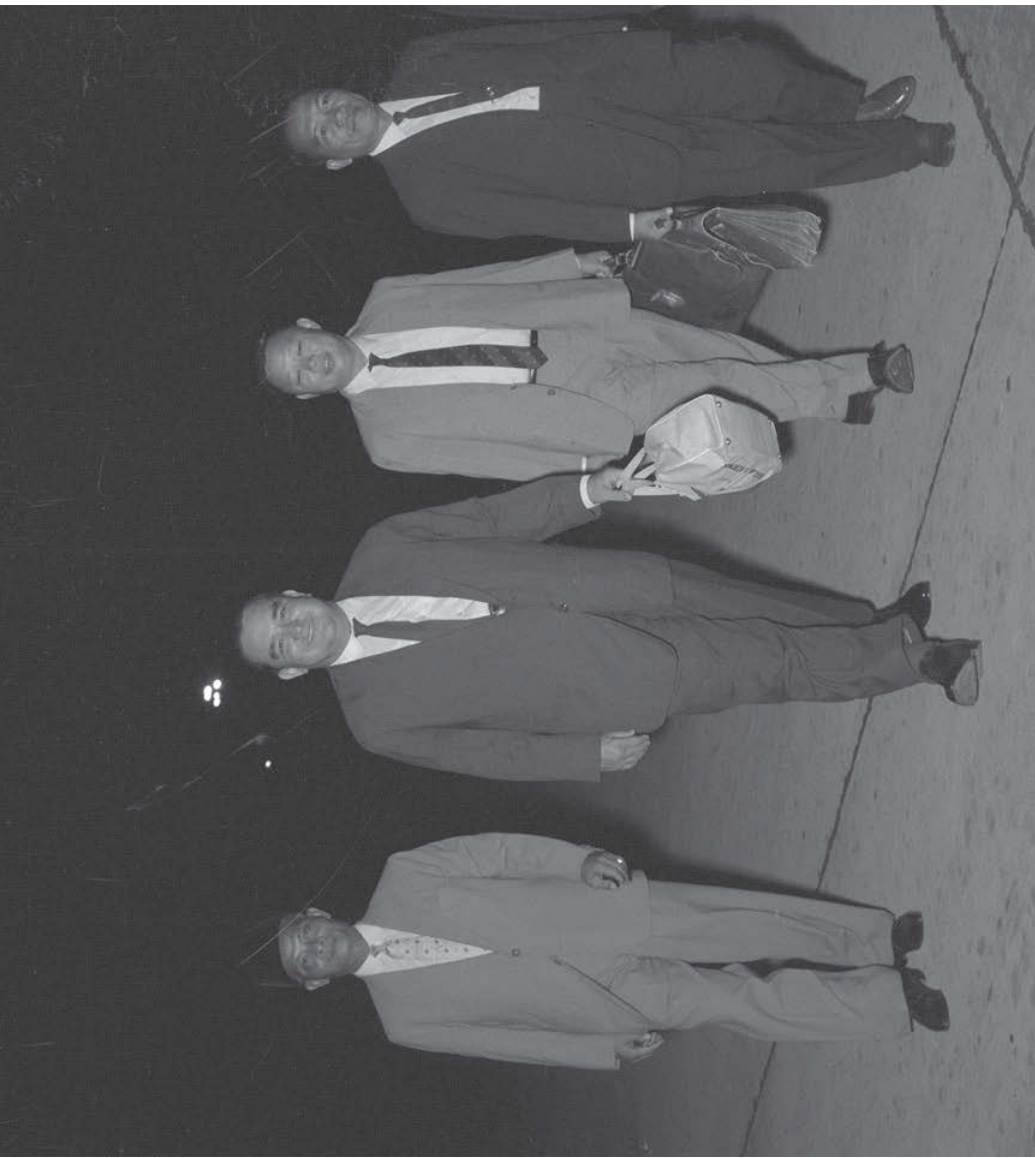
8) Delegates from North Borneo and Sarawak arriving in Singapore to see Tunku Abdul Rahman off for London talks.