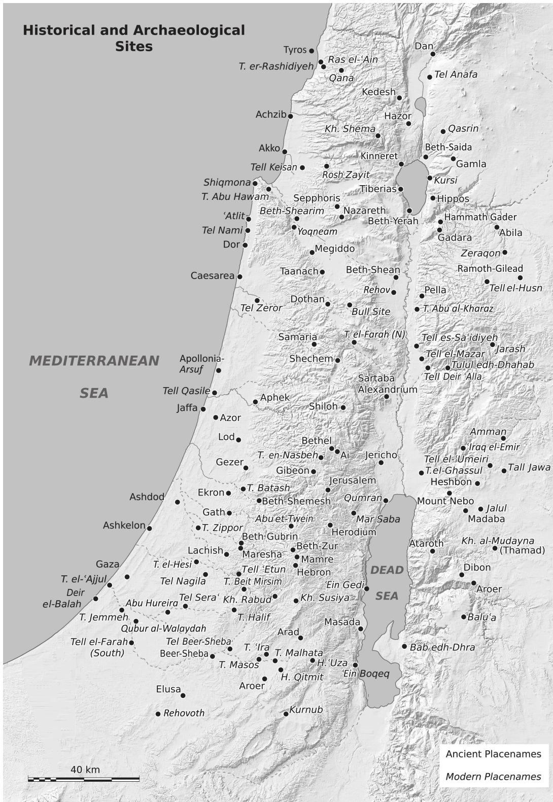
Introduction map #2: Archaeological and historical sites in the Southern Levant.