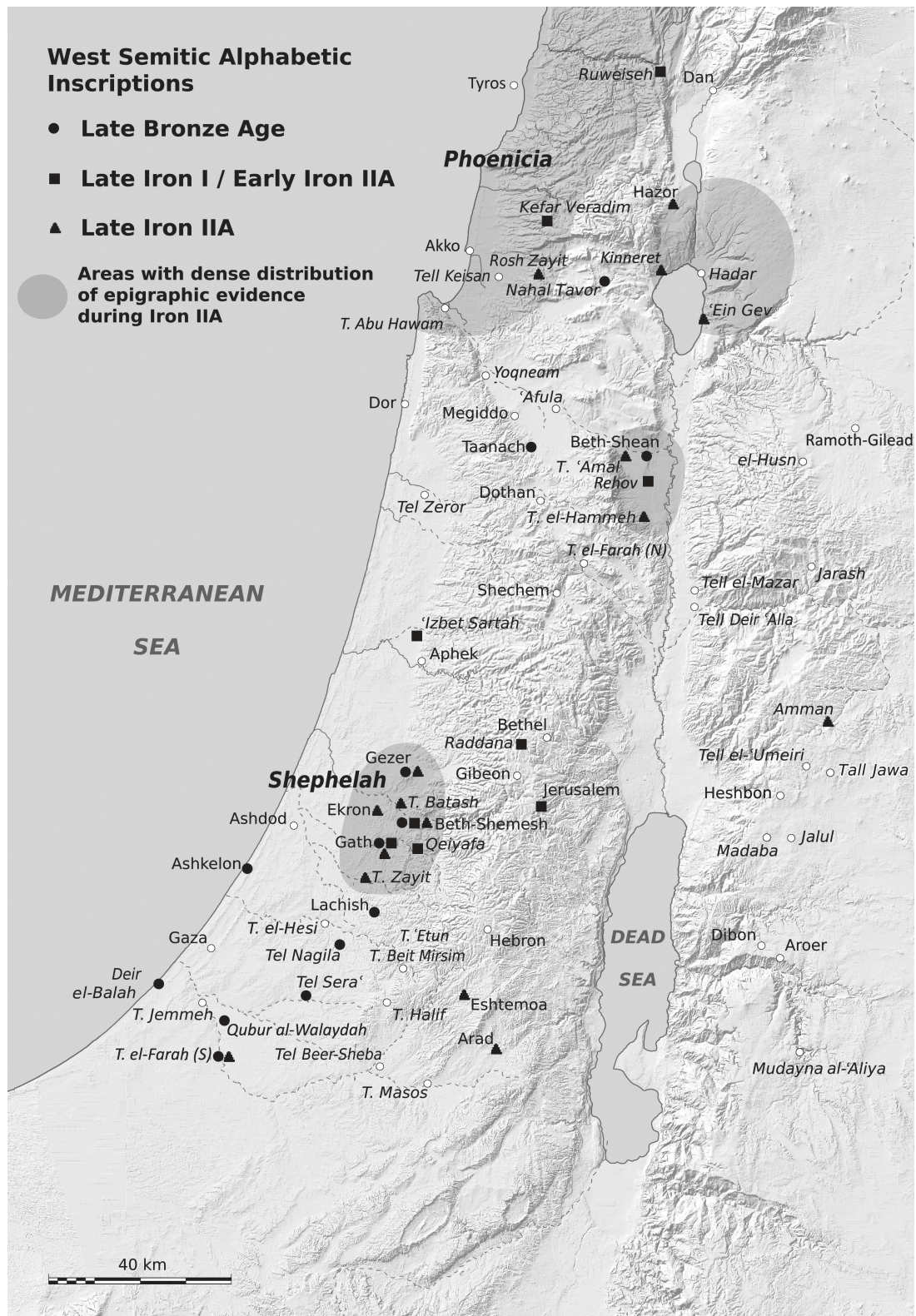
Introduction map #3: Distribution of early West Semitic alphabetic inscriptions.