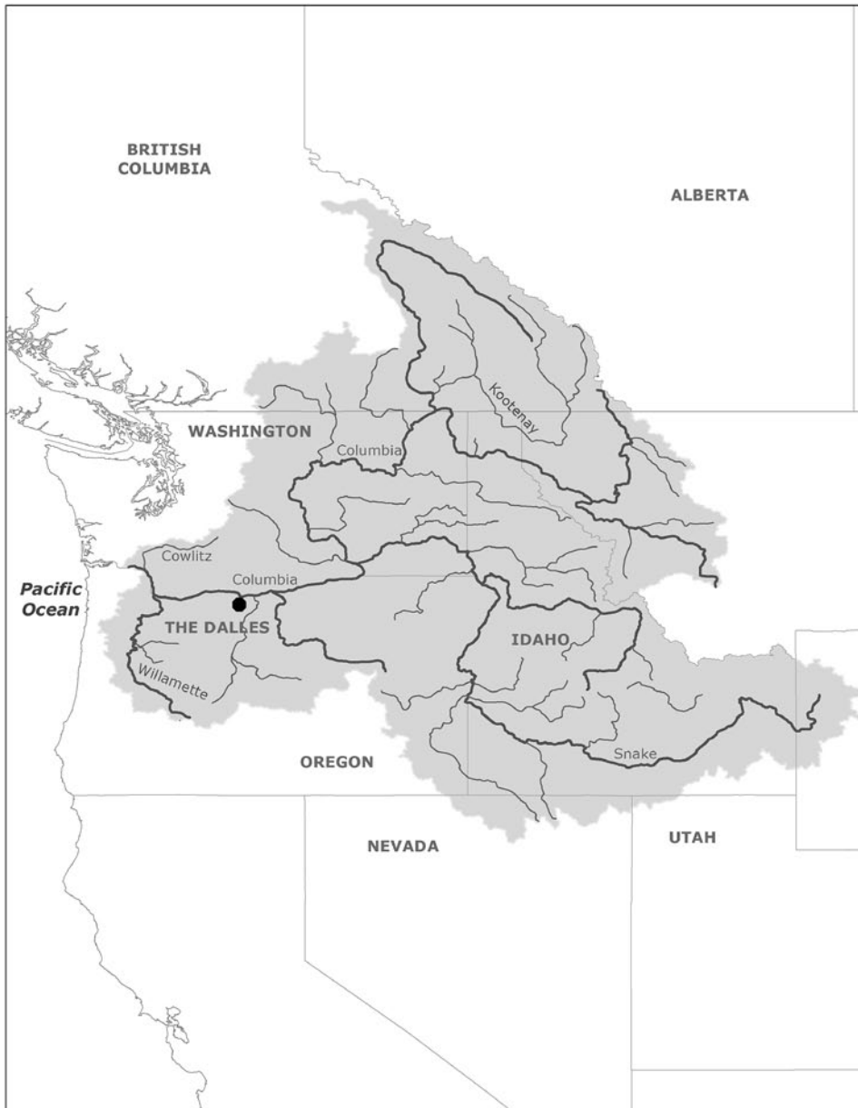
Figure 1. International cooperation in the Columbia River “basin”. The first agreement applying to the Columbia was the framework Boundary Waters Treaty signed by the US and Great Britain in 1909. The first treaty specifically mentioning the Columbia was signed in 1944 and limited to the “upper portion” of the basin. One additional treaty and four protocols were signed between 1961 and 1968 and focused on dam construction on the main stem within Canada and on the Kootenay tributary. Hydrologic measurements supporting the agreements are made at The Dalles, upstream of other “US” tributaries such as the Willamette and Cowlitz. No agreements apply to the overall basin, but Canada–US cooperation on the Columbia is generally considered some of the strongest in the history of transboundary waters.