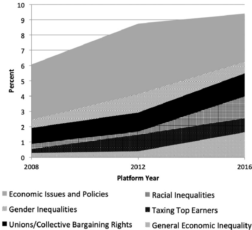
Fig. 1. Percent of Total Word Count of Democratic Party Platforms Dedicated to Various Topics.

platforms, the proportion of text dedicated to the discussion of economic inequality increased nearly sixfold, comprising roughly 1.6% of the total word count of the platform in 2016. Another category, “Taxing Top Earners,” was created to capture any discussion of raising taxes on top earners or functionally similar policies such as closing loopholes in the tax code utilized by the wealthy. Discussion of this specific issue of increasing taxes on the wealthy more than quadruples between the 2008 and 2012 platforms. And this proportion of attention to this category of policies holds steady into 2016 at roughly 1% of the total word count of the document.