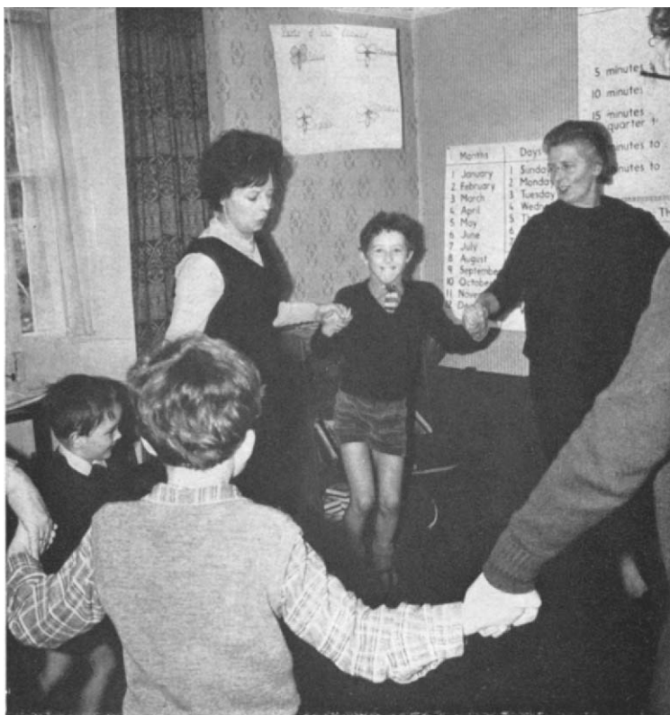
FRONTISPIECE. Autistic children form social relationships in sessions of group play and music and movement.