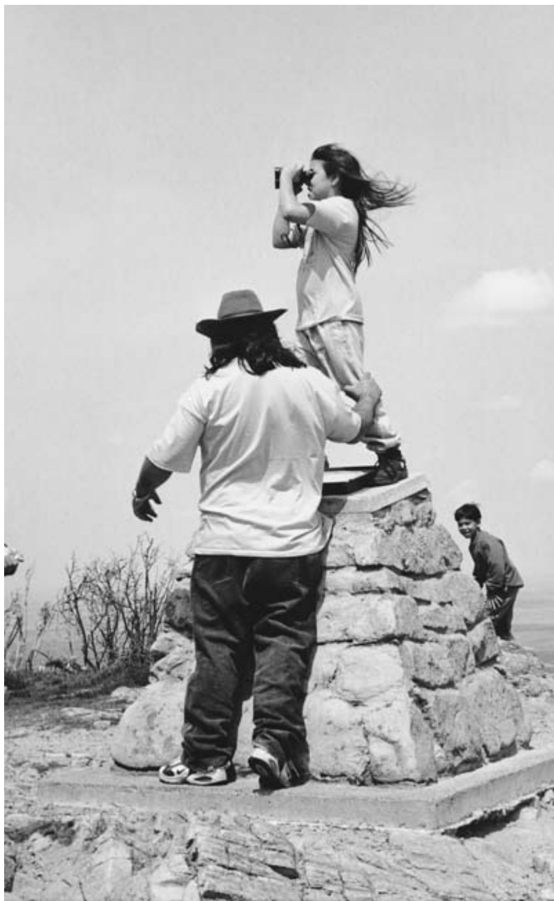
Father and son viewing the landscape from atop Steptoe Butte, May 1996