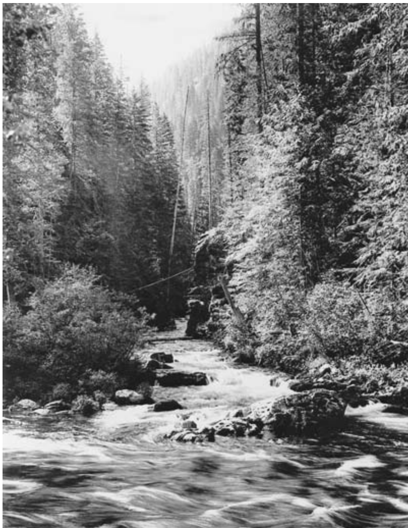
Swift water on the St. Joe River, c. 1910