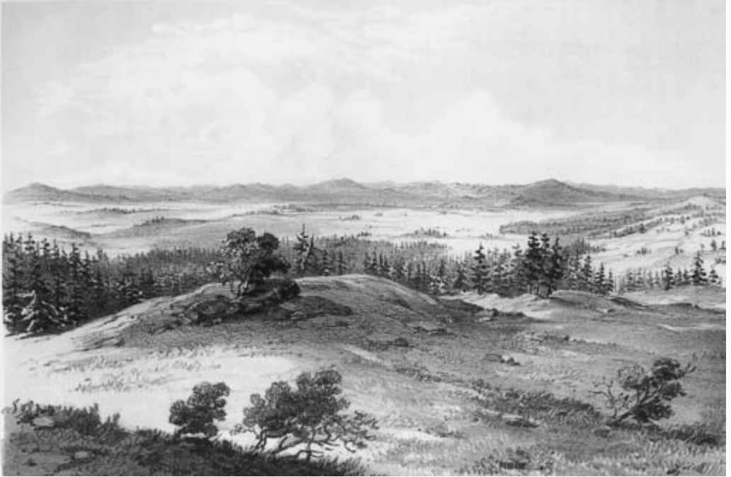
Camas prairie near the Palouse River (from John Mix Stanley's lithographs in Stevens 1855, pl. LXI)

family are oriented toward not what can be personally acquired and possessed but toward the opportunity to share with and “give back” to all members of the family, including the landscape itself.