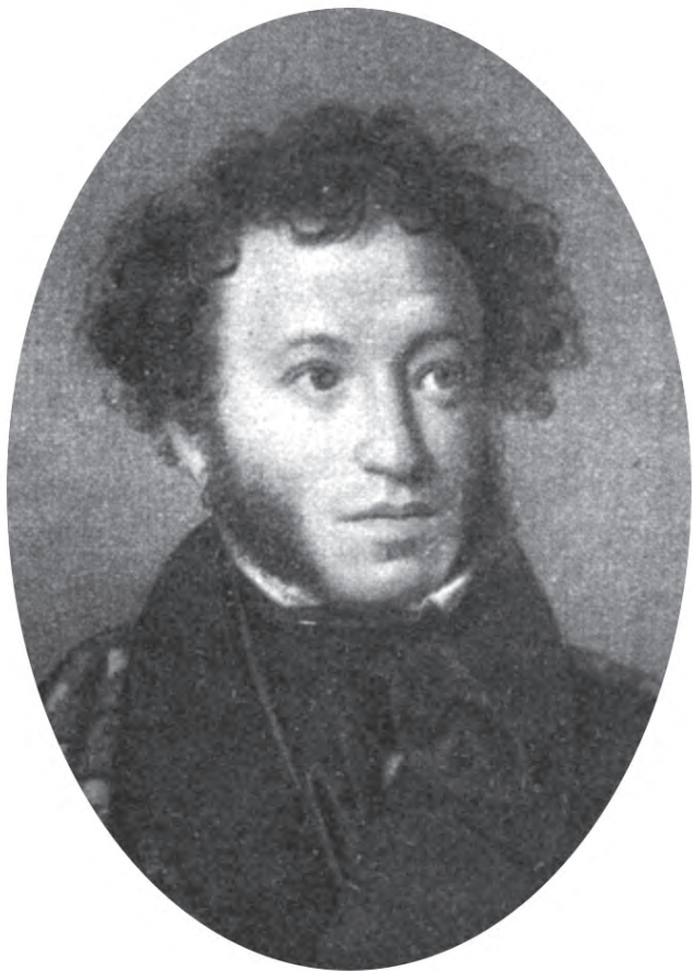
2. Alexander Pushkin (1799–1837), 1827 portrait by Orest Kiprensky.