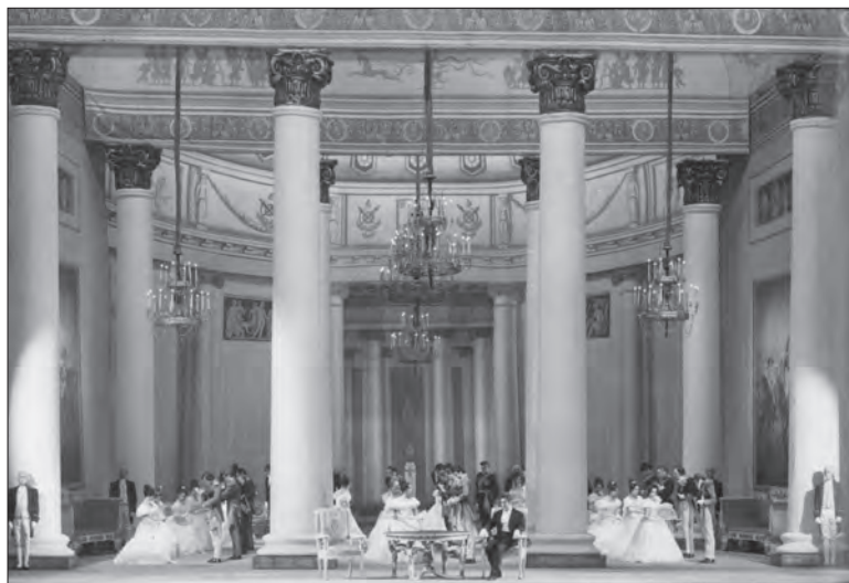
11. Act Three of Boris Pokrovsky's Bolshoi Theatre production (below).