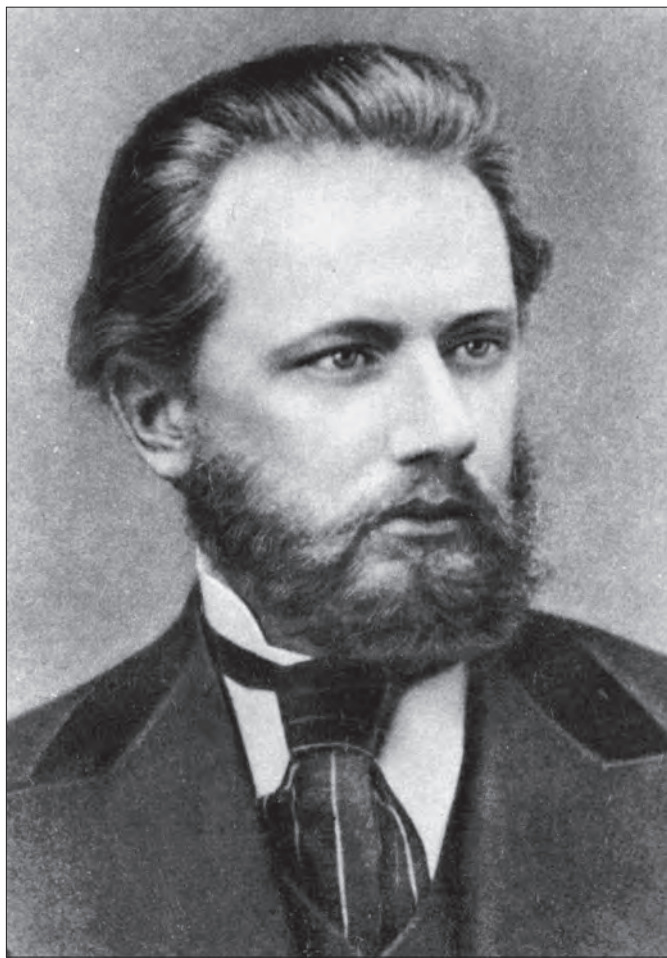
1. Pyotr Ilyich Tchaikovsky (1840–93) in 1879, the year of Eugene Onegin 's first performance.