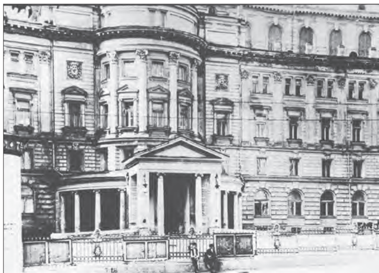
4. The Moscow Conservatory of Music, where Eugene Onegin had its first performance (above); 5. The cast of the first performance in Act Two, Scene One (below).