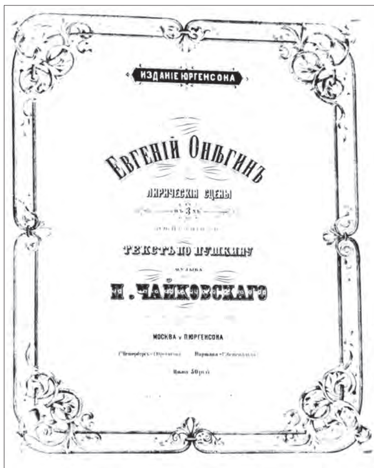
3. Title page of the first edition of the score, published by Jürgenson in 1880.