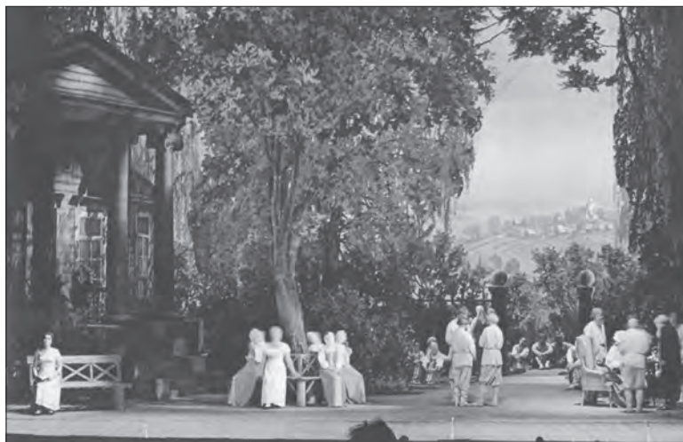
10. Act One of Boris Pokrovsky's classic production, designed by Alena Pikalova, at the Bolshoi Theatre, first seen in 1944 (above). It remained in the repertoire until 2006.