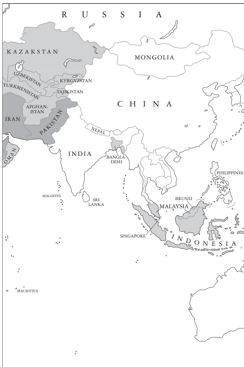
Map 2. (cont.)