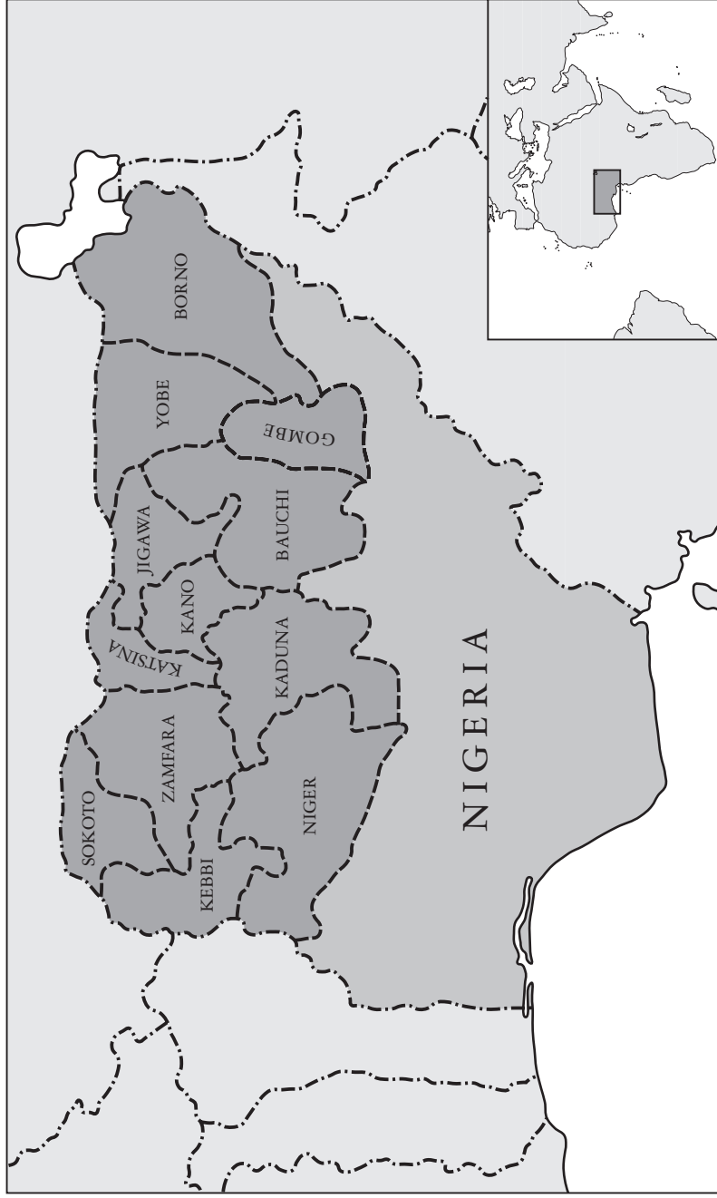
Map 3. The spread of Shari' criminal law in Nigeria (dark grey)